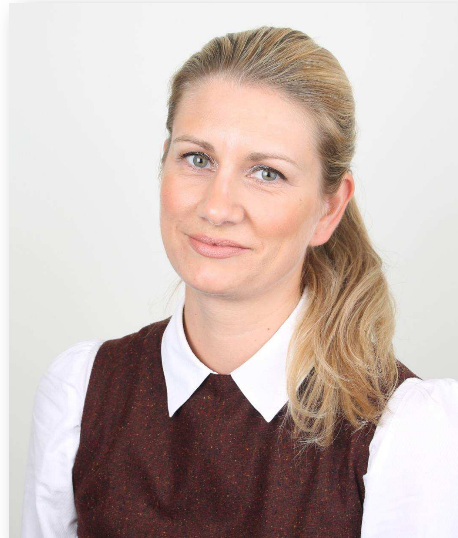
Dawn Bhoma Neon Underwriting