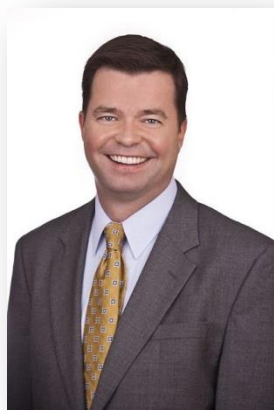
Tom Finan US Department of Homeland Security